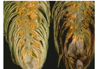
Aphid damage on hop at right