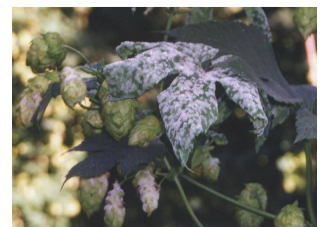
Powdery mildew on cones and leaves