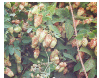
Red hops from powdery mildew