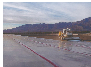
Applying fumigants on California strawberries