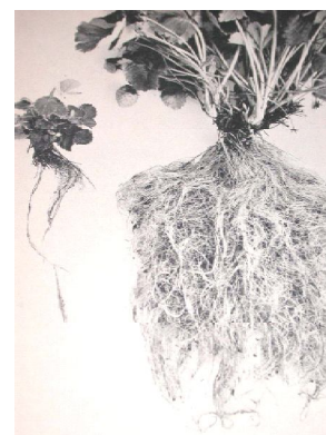
Fumigant effect on strawberry roots