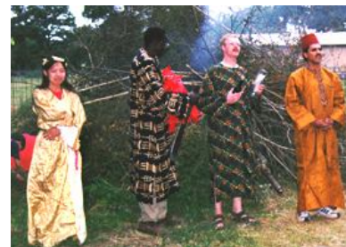
Texas A&M student reenacting Robigalia