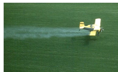
Fungicide spraying for wheat