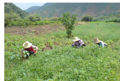
Hand weeding in China