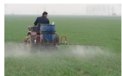
Herbicide spraying, China