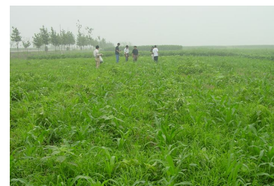
Weedy maize field in China