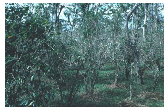
Coffee trees killed by rust