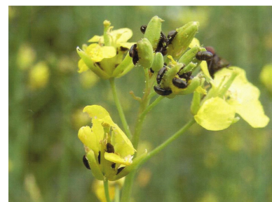
Beetles feeding on rape flowers and buds