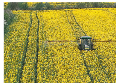
Spraying oilseed rape