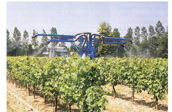
Fungicide sprayer in grapes