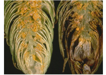
Aphid damage on hop at right