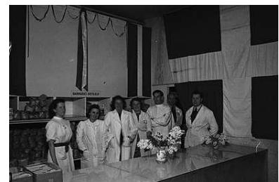
Danish humanitarian aid to Norway during WWII

Improved weed control with herbicides has been a major factor in increased cereal production in Norway [3]. By 1970, chemical weed control was practiced on 75-80% of the total cereal area in Norway. The resulting yield increase was estimated at 60,000 tons of grain annually (+10%) [3]. Recent surveys of Norwegian farmers show that more than 90% of the acres of cereal crops are treated with herbicides [4] [5]. In addition, about 75% of Norway's wheat acres are sprayed with fungicides and 20% are sprayed with insecticides.