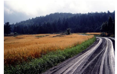
Norwegian wheat field

The population of Norway is about 5 million people. The difficult agricultural environment (harsh climate, mountainous terrain) contributes to a high cost of agricultural production [1]. Norwegian farmers enjoy the highest state subsidies in the world. 60% of their income comes from state subsidies. Norway currently imports about 50% of its food (energy-basis). The share produced in Norwegian agriculture increased from less than 40% in the 1950s to 50% today due to increased yields and production of wheat (Figure 1) [2]. Cereal crops (barley, wheat and oats) account for 75% of the crop acres in Norway.