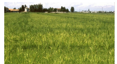
Weedy rice field in Italy