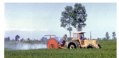
E.U. Rice: Herbicide Application