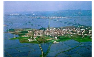
Flooded rice fields in Italy