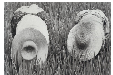
Le Mondine of the 1950s