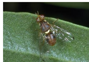
Olive fruit fly