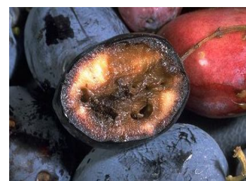
Decay and feeding damage from olive fly