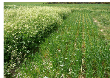
Right plot: Herbicide treated; Left plot: Untreated