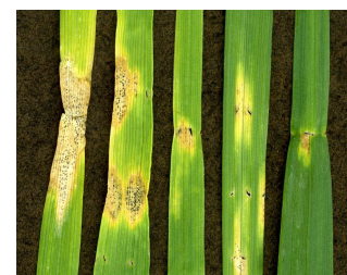
Septoria tritici blotch (STB) of wheat with symptoms decreasing from left to right