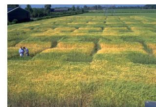
Wheat field being assessed for infection by STB