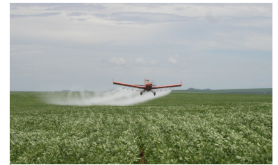
Spraying for soybean rust