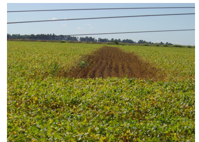
Soybean rust (untreated in center)