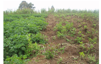
Potato late blight experiment in Cameroon: fungicide treated at left, untreated at right

Potato yields are low predominately because of late blight disease [5]. Yield losses due to the disease are attributed to both premature death of foliage and diseased tubers. Late blight was first reported in East Africa in 1941 and rapidly progressed over the potato-growing areas of Kenya and Uganda. Initially, control by spraying fungicides was not considered feasible for small growers and the importation of blight-resistant hybrids began [4]. However, the planting of resistant varieties has been ineffective as a control procedure because of the rapid appearance of new pathogen strains [6]. Farmers still grow potato varieties that are very susceptible to late blight because these varieties have a good taste and are preferred by consumers [1]. With good management practices, but without fungicide sprays, yield losses due to late blight in Africa have been estimated at 40-70% [6].