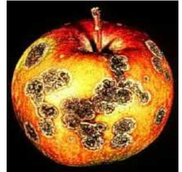
Scab Infected Apple