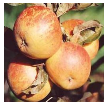
Cox's Orange Pippin