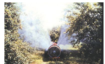
Pesticide Application in an Apple Orchard